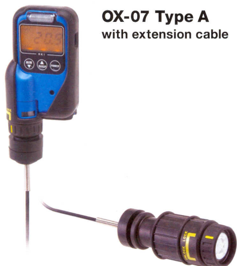
OX-07 Type A with extension cable