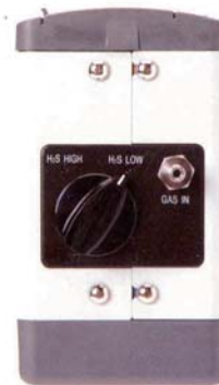
<H 2 S LOW>