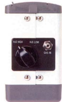
<H 2 S HIGH>

To measure high concentration Hydrogen sulfide (H 2 S), the model RX-517 applies a special H 2 S sensor with range 0-1,000ppm. When measuring high concentration H 2 S, turn the switch from "H 2 S LOW" to "H 2 S HIGH". This switch changes the LCD display, and unique flow path protects other sensors from exposure to high concentrations of H 2 S.